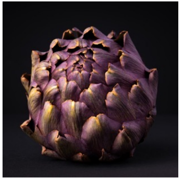
"Glowing Purple Artichoke" by Camen Au