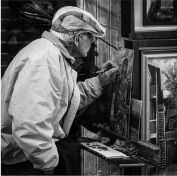
"Quebec City Street Artist" by Paul Rogne