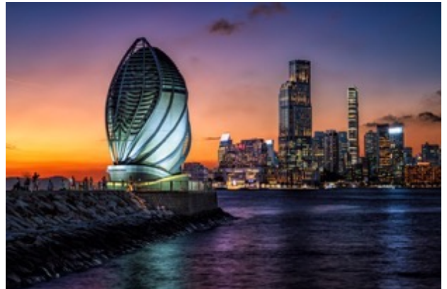
"Central-Wanschai Bypass East Vent at Sunset" by Elliott Lindgren