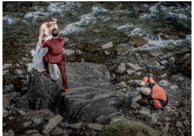
"Extreme Wedding Photography" by Tom Kleinert