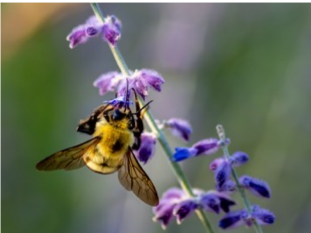
"Bee on Perovskia"