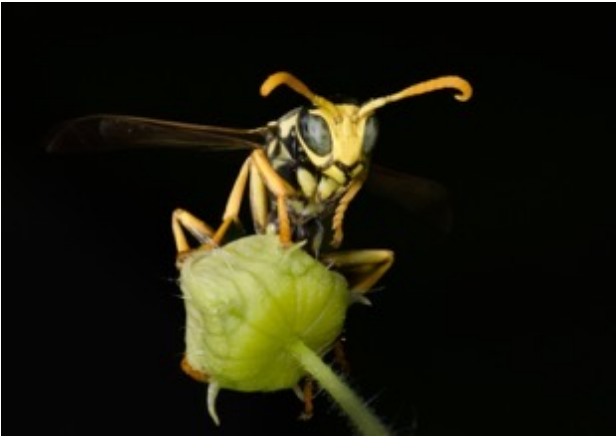
"Paper Wasp" by Ken Epstein