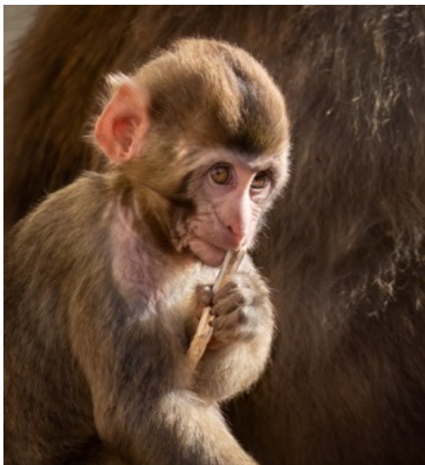
“I Wonder” by Ken Epstein